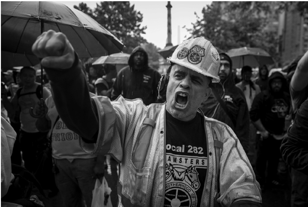
A New York construction worker demonstrates in anticipation of the Supreme Court's Janus ruling in 2018. Construction has suffered severe deunionization in recent years, leading to lower pay and degraded working conditions.

heavily unionized. Meanwhile, employers recruited immigrant workers, both authorized and unauthorized, to fill the newly degraded jobs in residential construction. Thus the employment of immigrants did not cause the labor degradation in the industry; on the contrary, it was the result of the employers' anti-union campaigns. Similar processes unfolded in many other industries as well. But rank-and-file workers, as well as some unionists, unaware of this dynamic, often blamed immigrants instead for the degradation of jobs.